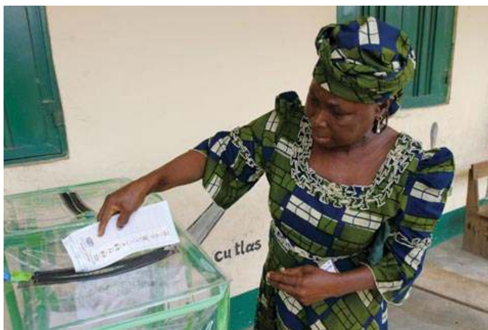
A polling station in Nigeria: From voting to holding elective office, Africa women are pressing for a bigger voice in political affairs.