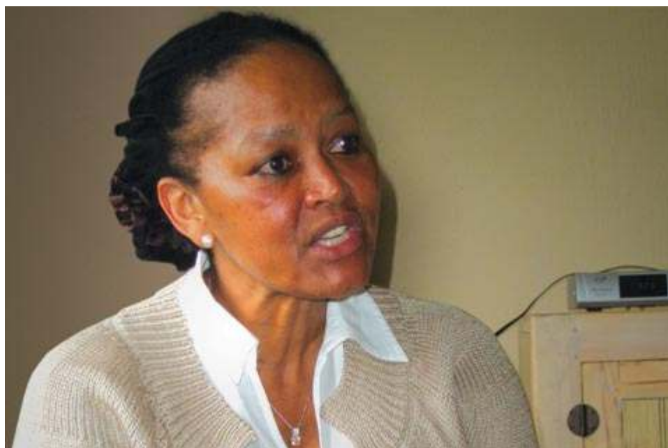
“Women’s political representation is absolutely important,” Nomcebo Manzini, head of UN Women for Southern Africa.