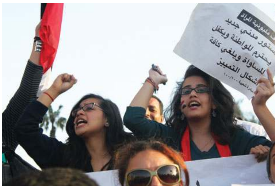
Women in Cairo calling for equal rights.

2010 and 2011 were very important years for women's political participation. In 2010, gains for women were registered in just half of all parliamentary elections or renewals. The most notable progress was seen in Northern Africa in post-revolutionary Egypt, Tunisia and Libya. North Africa saw women's representation in single or lower houses increased from 9.0 per cent to 11.7 per cent between 2010 and 2011. In Tunisia, the gender equality law was enacted by the recently elected Tunisian Islamist Party as a basic law that can only be repealed by two-thirds majority, (as opposed to a law that can simply be repealed by a soft majority). 2 While the gender equality law is not perfect, it is a great first step.