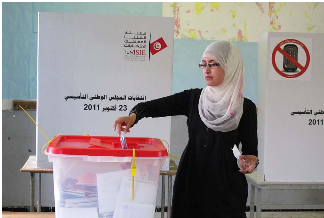
WOMAN VOTING IN TUNISIA CONSTITUENT ASSEMBLY