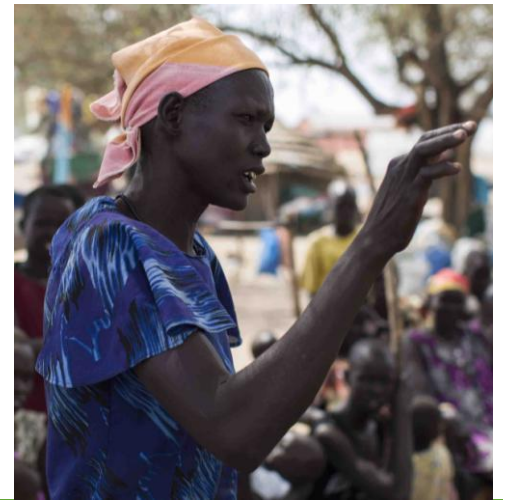
Clockwise from left: teaching women literacy and political rights in Yemen; a policewoman in Afghanistan; a villager addressing an Oxfam public health meeting in South Sudan; a Syrian refugee in Lebanon; discussing local peace issues in South Sudan. Credits on back page.