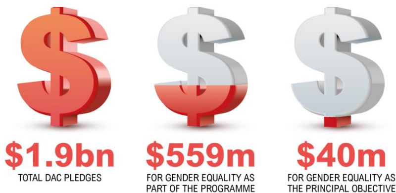
Figure 2: Funding pledged by DAC donors for peace and security programming in fragile states, 2012 and 2013